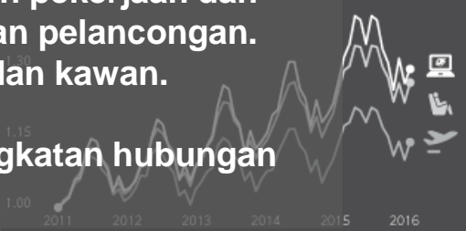
RELATIVE AVIATION MARKET SIZE BY WORLD REGION FEBRUARY 2016